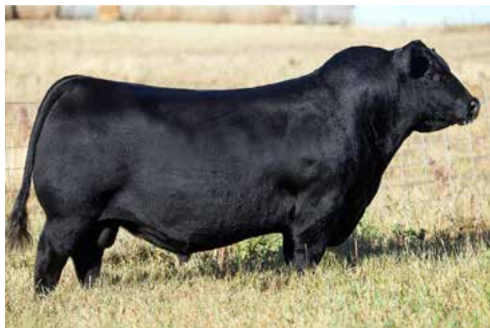
BROOKING BANK NOTE 4040 - Sire of Lot 82

Calving ease, efficiency, skeletal integrity, and a great matron support this one's campaign to be your next herd sire. His dam is one of the absolute most powerful daughters of HA Cowboy Up 5405 in the program with the longevity-minded, maternal presence of another BC prefixed stud, BC Lookout 7024. This stud charts the top 15% for $M, Doc, Claw, and Angle, the top 20% DMI, top 25% $EN, with CED that keeps him within reach of the top third of the breed.