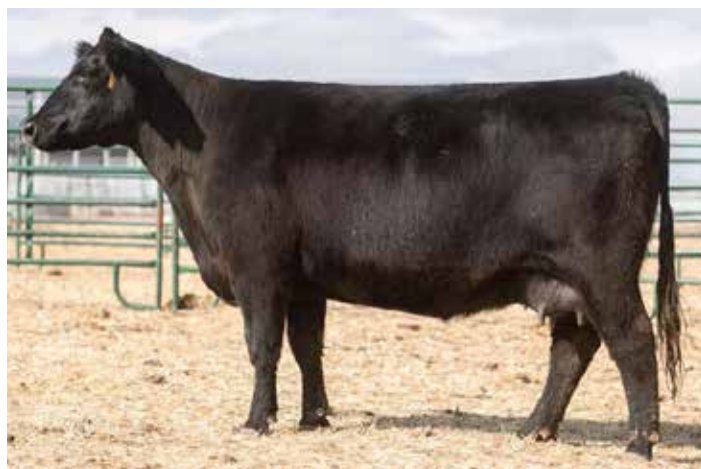
BAR S PRIDE 7808 - Paternal Granddam of Lots 63-67

The basic fundamentals of maternal ability are stacked deep and tight in this sire's maternal lineage. Several cows support the bottom side with industry-accepted calving intervals and substantial udder quality and production integrity. He ranks in the top 10% for $EN, DMI, and Claw, with top 20% for Angle and PAP.