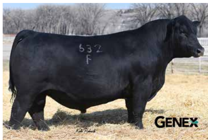
SITZ BARRICADE 632F - Sire of Lots 36-44

The cattle by the Patriarch, Bar S Range Boss 1118, continue to produce the stock that keeps all operations in the black. The dam of 2916 is one of the most powerfully built females on the ranch and she continues to generate the lead-off kind as one finds in this direct son of Sitz Barricade 632F. He's quite the prospect with top 15% WW, YW, and $F with multiple other profit drivers in the top third of the industry.