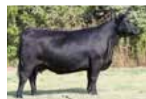
BAR S BLACKBIRD 9108 Dam of Lot 35