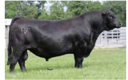
DEER VALLEY GROWTH FUND Sire of Lots 210 & 211