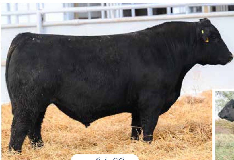
BC CERTIFIED 413-1 Paternal Grandsire of Lot 83