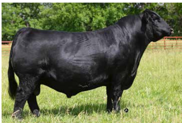
SILVEIRAS FORBES 8088 - Sire of Lot 215

PE 6/6/23 to 7/29/23 to BAR S ALPHA 0394 (AAA: 19909452)