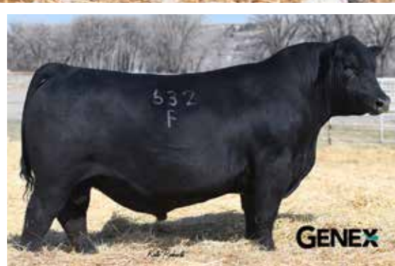
SITZ BARRICADE 632F - Sire of Lots 1-11

The maternal side is laced with the proven matriarch of the Bar S Pride family who is also the full sister to Bar S Range Boss 1118 which they refer to as Bar S Pride 4919. "4919" is quite impressive and even more so in her working clothes. Either member of this trio will enhance any program with male progeny to pound the scales at weaning and a set of females that anyone should desire to retain. Buy and select with confidence!