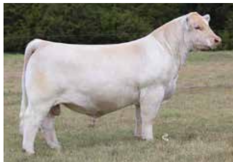
CCC WC REDEMPTION 7143 PLD ET Sire of Lot 129

This "Resource" grandson is from an ultra-productive daughter of LT Rushmore 8060 PLD who posts some impressive figures and arithmetic. He is very sensible at birth and posted a 797-pound weaning weight. He too should drive an operation to retain the females as he is the number one Milk value bull in the Charolais offering ranking in the top 2% and top 15% for MTL. The convenience traits of BW rank in the top 20% and CE in the top 25% with added value in the end product as he stays in the top third for Marb and the top half for REA. Quite the draft prospect for your operation.