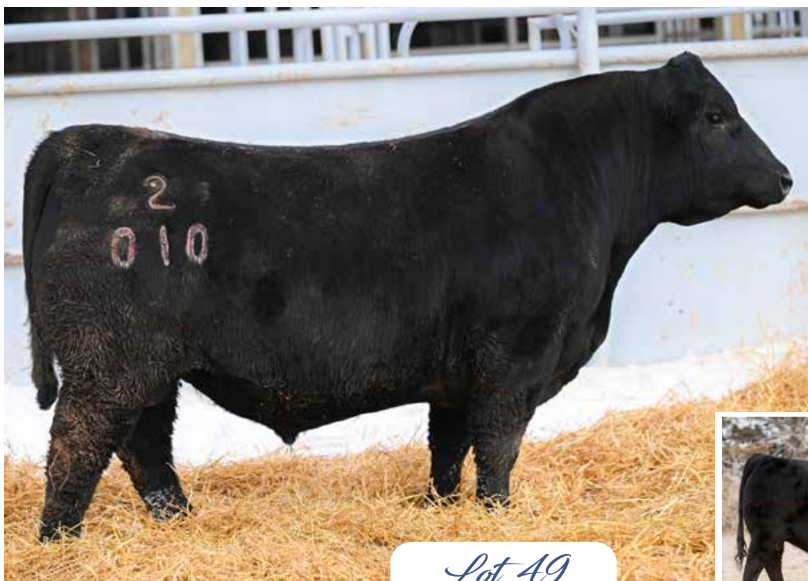
BC ALPHA C1327 Sire of Lots 49-55 & Maternal Grand sire of Lots 56-67