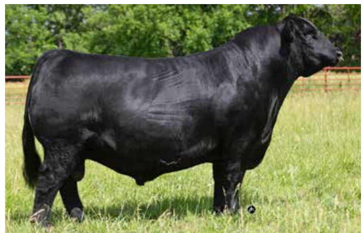
SILVEIRAS FORBES 8088 - Sire of Lots 201-203

Here is one very stout-boned, big-footed female that has the body shape, genuine skeletal width, and balanced look with presence to take any program to the next level. This high-quality female is from the Bar S Pride 3723 dam that was a Reserve Division Champion at the 2015 National Junior Angus Show in Tulsa, Oklahoma that year. She's for serious stockmen only that should trend to be low input with breed leading values for DMI and $EN.