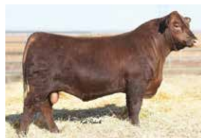
COLLIER FINISHED PRODUCT Paternal Grand sire of Lot 94