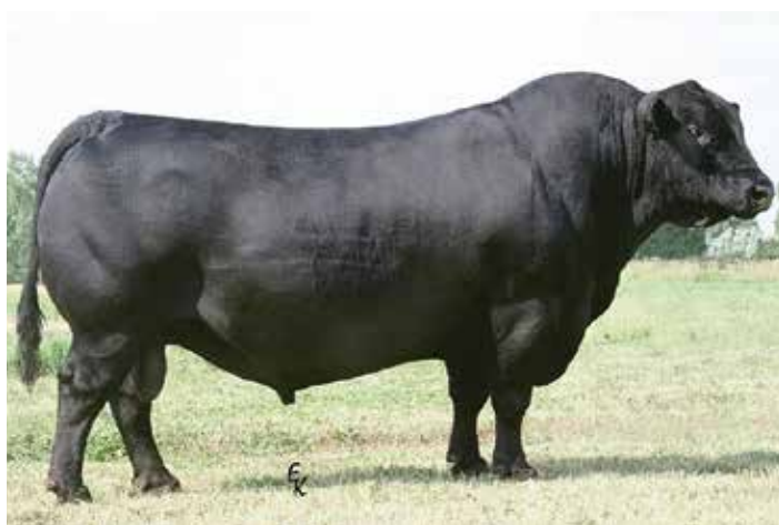
S A V FINAL ANSWER 0035 - Maternal Grandsire of Lots 40 & 41