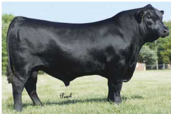
CONNELLY THUNDER - Maternal Grandsire of Lot 45