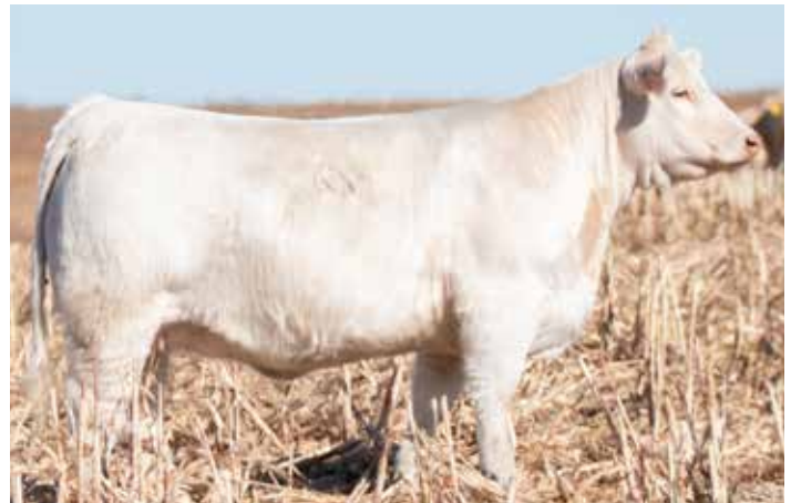
BAR S ANNIE 8363 - Full Sister to Lot 115

Certainly, one of the very big heavy bulls in the pen posts a weaning ratio of 114 with 739 pounds recorded. Impressive to say the least, but he does come loaded with longevity in cow power as his dam is 13 years of age and continues to do the job year after year.