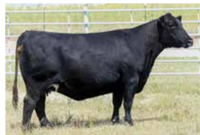
BAR S EILAZANE 4410 Dam of Lot 201 & 202

For the cattlemen and women who prefer the phenotype and balance, we are certain that you will find these two full sisters when the videos are posted and when you are in person on sale day. The donor dam responsible, Bar S Eilazane 4410 is featured throughout this sale book as she consistently shells out the goods. If you prefer your stock to be deep, square, sound, and angular with a documented matriarch that supports them, then you should be the new owner of one or both of the Silveiras Forbes females from the proven Bar S Eilazane 4410.