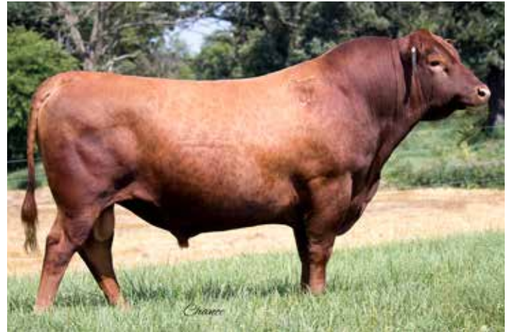
LSF RHO NIGHT FOCUS 76B - Sire of Lot 98

Here is the red-hided stud to get amped up about in the offering and has the credentials to support the claim. He's the kind any progressive seed stock operation and bull stud needs to study. Besides his great phenotype, he came to the weaning pen to record a 103 WWR, he too posts substantial EPD values for both WW and YW performance drivers in the top 4%. His contribution to any program is considered to be better than well-rounded with ProS and GM values in the top 3% of the industry supported with a top 4% value for Marb. Maternally he is balanced as well, between the quality of his dam and the sensible expectations on paper, the set of daughters he could leave behind should be beyond fantastic and profitable as well. Bar S Ranch has big expectations for what this bull can do for the business and the end product.