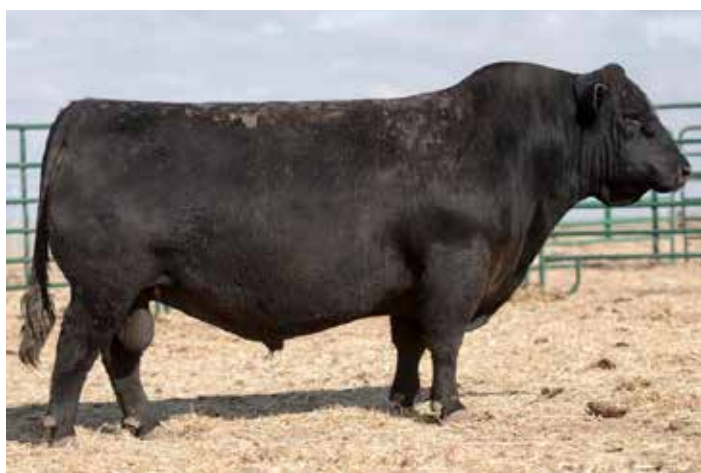
BAR S RANGE BOSS 1118 - Paternal Grandsire of Lot 216

PE 6/6/23 to 7/29/23 to BAR S ALPHA 0394 (AAA: 19909452)