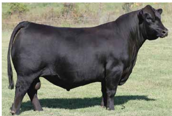
STEVENSON TURNING POINT - Maternal Grandsire of Lot 22

We are very impressed with the cattle by Baldridge Alternative E125. They come with the extras in terms of body and substance. Bar S Alternative 3120 is from another impressive daughter of Stevenson Turning Point who qualified for the CAB badge and should be one of the go-to heifer bulls on sale day as he is expected to stay in the top 4% of the business for CED. He too keeps his maintenance value high as he charts the top 10% for Claw, PAP, and HS thus telling us that he and his stock should thrive and minimize any issues in a multitude of climates and environments.