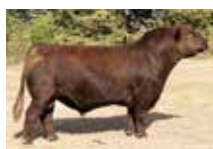
BAR S HANCOCK 9014 Sire of Lots 108-110

This son of "Hancock" is low birth and sensible for carcass merit. He's bred to fit any environment and will cover several cows.