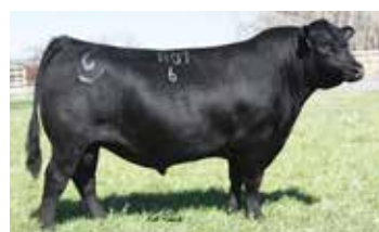
SITZ ALPINE 11076 - Sire of Lot 89

BUSHES SURE DEAL 33 BAR S PRINCESS 6315 BAR S PRINCESS 8230