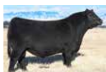
NORTH CAMP SILVER STAR 5103 Maternal Grand sire of Lot 50

The "Alpha" sons just continue to impress at every stage of maturity. This animal posts a top 4% value for Claw and is a very good-footed individual like most in the sire group. He too posts a top 10% $EN value and so with his lineage, there is no question to the overall efficiency and quality of daughters that he will leave in any program. He is from a very strong and profitable cow family with his maternal granddam producing the 2020 Bar S Ranch high-selling lot selected by Nordlund Stock Farm of Minnesota.