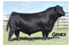
KG JUSTIFIED 3023 Sire of Lot 33

This is the only KG Justified 3023 son of the offering and comes with the CAB seal of premium potential. He posts profit drivers in the top 15% for $M and top 20% for $W. 3076 is very good at the surface, and athletic with substance and shape. He charts in the top 3% for Claw and Angle with performance and maternal expectations to meet the demanding challenges of today's beef business. He too comes with the support of a great set of matrons on the bottom side of his lineage. Invest with no questions asked.