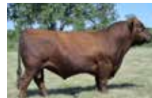
BIEBERT CL STOCKMARKET E119 Sire of Lots 101-103