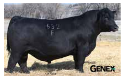
SITZ BARRICADE 632F - Sire of Lots 204-206