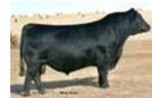
KRAMERS APOLLO 317 Maternal Grandsire of Lot 44

Another blend of the best of the western Nebraska and eastern Montana regions can be found with the 632F back on the maternal sister to Barstow Cash. Not only should he and his cattle be suited at higher elevations with a top 2% value for PAP, but the proven maternal power and influence would be unrivaled within the set. He is in the top 3% for $M, top 2% for HP, top 10% CEM, and yet has values for $EN and Milk in the top end of the business. There is little to question with this prospect leaving a set of daughters worthy of retention.