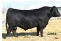
SITZ SPECTRUM Sire of Lot 32

The lone son of Sitz Spectrum in the entire offering who merits the possibility of heavier use of the sire in the future. He is one of the go-to bulls in the offering for calving ease with industry-improving growth to satisfy the needs for pay weight. He is also the Scrotal leader of the sale offering to rank in the top 1% in combination with maternal figures in the top 25% CEM, and top 30% HP indicating that he should leave a set of daughters that arrive at puberty earlier than their contemporaries and should have the fertility to go the distance and remain in the program for the years ahead with sustainable milk production. 3358 is also an index leader as he posts the top 15% for $F, the top 20% for $M, and the top 25% for $C and $W.