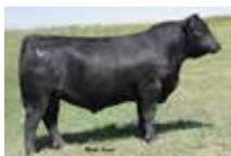
CONNEALY ARSENAL 2174 Paternal Grandsire of Lots 85 & 86

An age-advantaged stud that blends some of the very influential sires of the Angus business. Bulls like Sitz Upward 307R, Connealy Frontline, Connealy Freightliner, and Connealy Arsenal 2174 highlight the lineage along with the Pathfinder-qualified maternal granddam. Top 5% for $EN, top 10% DMI and HP, and top 15% $M on his impressive job application.