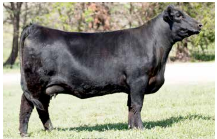
BAR S PRIDE 4487 - Maternal Granddam of Lot 204

Here is one that is very cowy, deep, and functional from every angle. Her maternal great-granddam carries the Pathfinder title and was one of the top indexing cows of the program for her lifetime. Her direct dam by Musgrave 316 Stunner is proving her worth to the operation and as she matures they do expect big things from her.