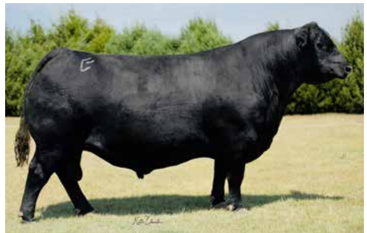
BALDRIDGE ALTERNATIVE E125 - Sire of Lot 209

We love this female for what she has to offer from a balance, build, running gear, and pedigree standpoint. These Baldridge Alternative E125 daughters are proven to be very valuable and are more than qualified as calf raisers who will contribute to the industry tenfold.