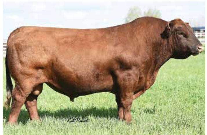
WFL MERLIN 018A - Paternal Grandsire of Lot 100

Growth and maternal in combination is very rare when the values for those respective traits are the values that they are. This descendant of the "Merlin" sire line is very indicative of what the line is known for. He ranks in the 7% for YW, the top 8% for WW and ADG, and the top 11% for Milk.