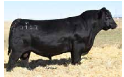
TEHAMA TAHOE B767 Sire of Lots 207 & 208

Elegance, refinement, high society, and exquisite all come to mind when we analyze this daughter of Tehama Tahoe B767 in person. Her dam is the very best two-year-old daughter of E&B Plus One and is stacked with generations of udder quality, fertility, and calf-raising merit.