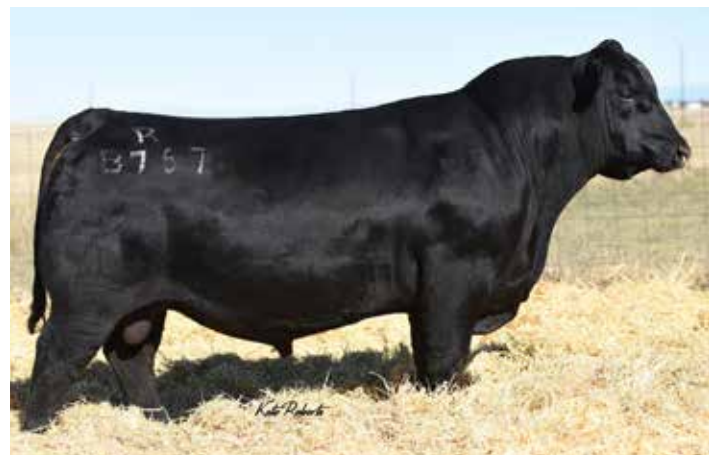
TEHAMA TAHOE B767 - Sire of Lots 12-16

The Tehama Tahoe B767 cattle have been well received for their scale-pounding performance and industry contributions regarding the end product. This CAB qualifier will gather up plenty of friends come sale day for not only is he impressive on the hoof, but he also raises the bar for several profit drivers as well. He ranks in the top 3% for $W, top 4% $M, and top 25% beef on dairy values with top 30% $C and $G index values. 3023's two-year-old Bruns Blaster sired dam contributed all the good to her first calf and assisted him to rank in the top 10% for WW, top 20% for YW, with BW value in the top third. Balanced performance, maternal, carcass, management, and profit values to solidify his resume as a herd improver.