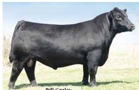
B C LOOKOUT 7024 - Maternal Grandsire of Lots 2-4