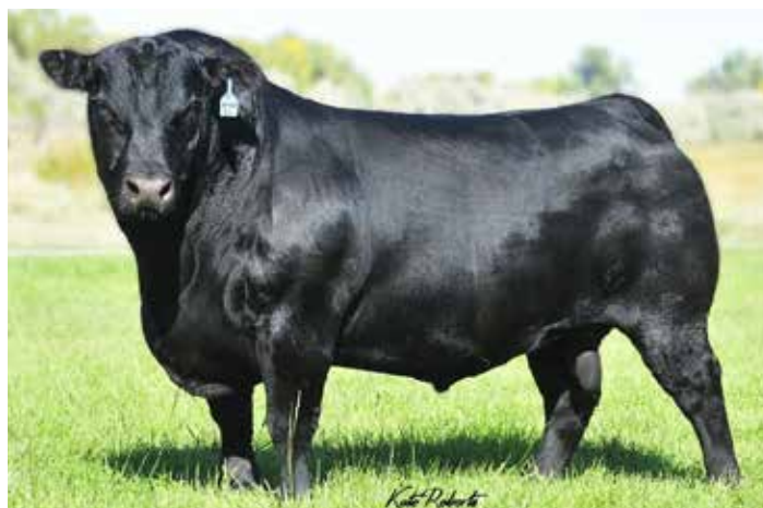
LD CAPITALIST 316 - Maternal Grandsire of Lot 23

This bull should have made the picture pen, but with the weather and schedules it did not happen. A son of "Alternative" from a deep, wide, square built daughter of LD Capitalist 316. 3133 is a CAB qualifier that ranks in the top 10% for CED, CEM, and PAP, top 20% BW, Angle, and $AxH, with top third values for the WW and YW.