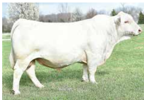
LT RUSHMORE 8060 PLD Maternal Grandsire of Lot 130