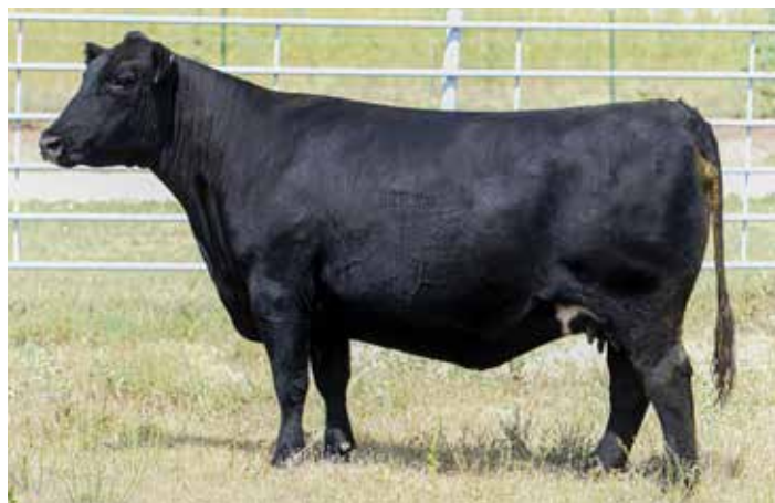
BAR S EILAZANE 4410 - Dam of Lot 1

This son of Sitz Barricade 632F is from one of the very potent donor dams in the entire Bar S Ranch program. He is the full brother to two of the three members of the 2024 Reserve Champion Pen of Three Angus Females at the National Western Stock Show. The flush is loaded with dimension, body, fleshing ability, and beef industry merit.