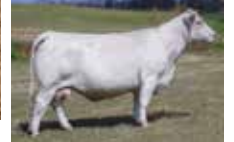
BAR S ANNIE 4905 Dam of Lot 113