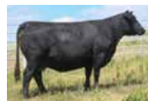
BAR S PRIDE 4919 Dam of Lot 34