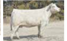
BAR S PISTOL ANNIE 1542 Dam of Lot 114