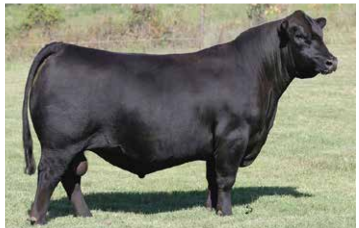
STEVENSON TURNING POINT - Maternal Grand sire of Lots 13 & 14

We do admire the look and build of this Tehama Tahoe B767 son from a rookie dam sired by the influence of Stevenson Turning Point. This stud is certainly long, smooth, very attractive, and has the running gear for longevity. He is a significant index leader among the entire offering ranking in the top 5% for $M, top 10% for $W, top 15% for $C, and for both Angus on Dairy values and top 25% $G as well. For his expected performance values, he ranks in the top 15% for WW, top 20% YW with very sensible CED and BW combined with the outstanding top 10% for Claw and Angle as well. This stud has a great probability of working in higher altitudes and maintains carcass drivers that will keep your calves in the premium bound lines when harvested. Well-rounded and well-documented.