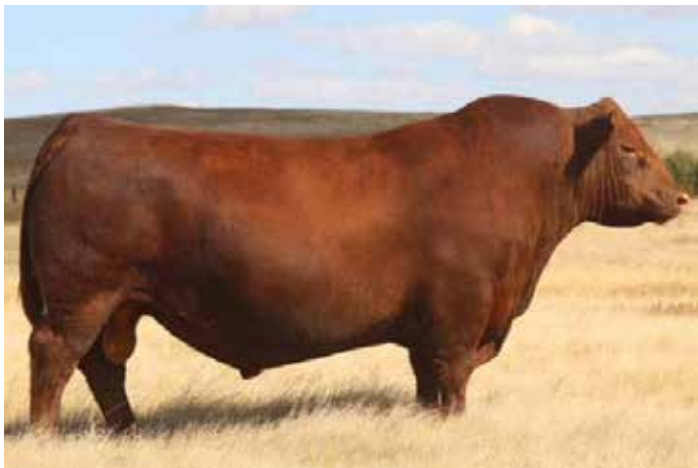
KJL/CLZB COMPLETE 7000E - Sire of Lots 95-97

This son of KJL/CLZB Complete 7000E is blood-red in color with big-time growth on board with the assist from his very good dam. SPUR Alfrida 2697F brings the big sappy calves to the weaning pen consistently each year. 3105 is loaded with true width, dimension, and substance and weaned off at nearly 700 to ratio 103. He ranks in the top 13% for WW, YW, and ADG with above breed average carcass, calving merit, and index values.