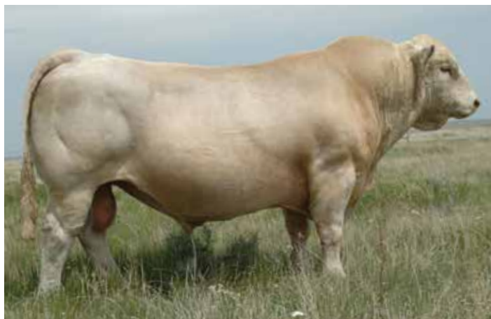
LT BLUE VALUE 7903 ET - Paternal Grandsire of Lots 131-134