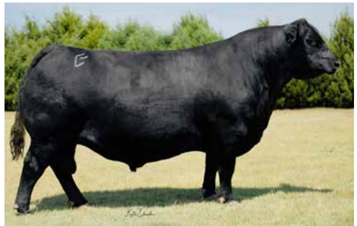
BALDRIDGE ALTERNATIVE E125 - Sire of Lots 17-28

The curve-bending Angus herd sire prospect of choice from the Baldridge Alternative E125 sire group! What an individual who posts top 5% for WW, and top 10% for YW and PAP with a top 20% $F profit driver. He is also from one of the very big bodied, low input, high quality daughters of the BC Alpha c1327.