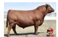
RAVN LINEBACKER C537 Sire of Lot 111

The cattle by RAVN Linebacker C537 are very solid and when they are supported by a dam like this one has to his claim, they are second to none. This stud sets the bar for ADG in the top 9%, top 18% YW, and top 32% for WW with above industry standards for carcass as well.