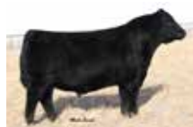
BARSTOW CASH Maternal Grandsire of Lot 43

This low birth son of Sitz Barricade 632F is another one of strong consideration for our friends in the mountainous regions of our great nation as he charts in the top 3% for PAP. What we admire most in this prospect is the proven and dominant influence of the legendary Krebs Ranch sire, Barstow Cash. The cattle by "Cash" have been well received over the past several years and his influence on the Angus breed and the commercial sector of the industry remains strong yet today. Invest with utmost confidence as his dam will justify any level of investment.