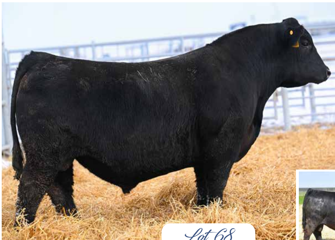
HA COWBOY UP 5405 Maternal Grand sire of Lots 68-74