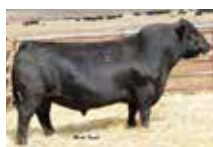
APEX WINDY 078 Maternal Grand sire of Lots 53 & 54

A herd sire that is acceptable for use on any heifer project of size and scope. He ranks in the top 15% for BW and is a big $EN sire of choice. He's supported by the proven maternal and calving ease patriarch, Apex Windy 078.