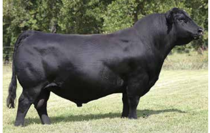
BC ROBUST 0807 - Paternal Grandsire of Lot 212

PE 6/6/23 to 7/29/23 to BAR S ALPHA 0394 (AAA: 19909452)