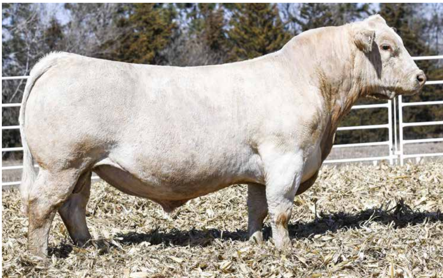
CCC WC RESOURCE 417 P - Sire of Lots 129-133