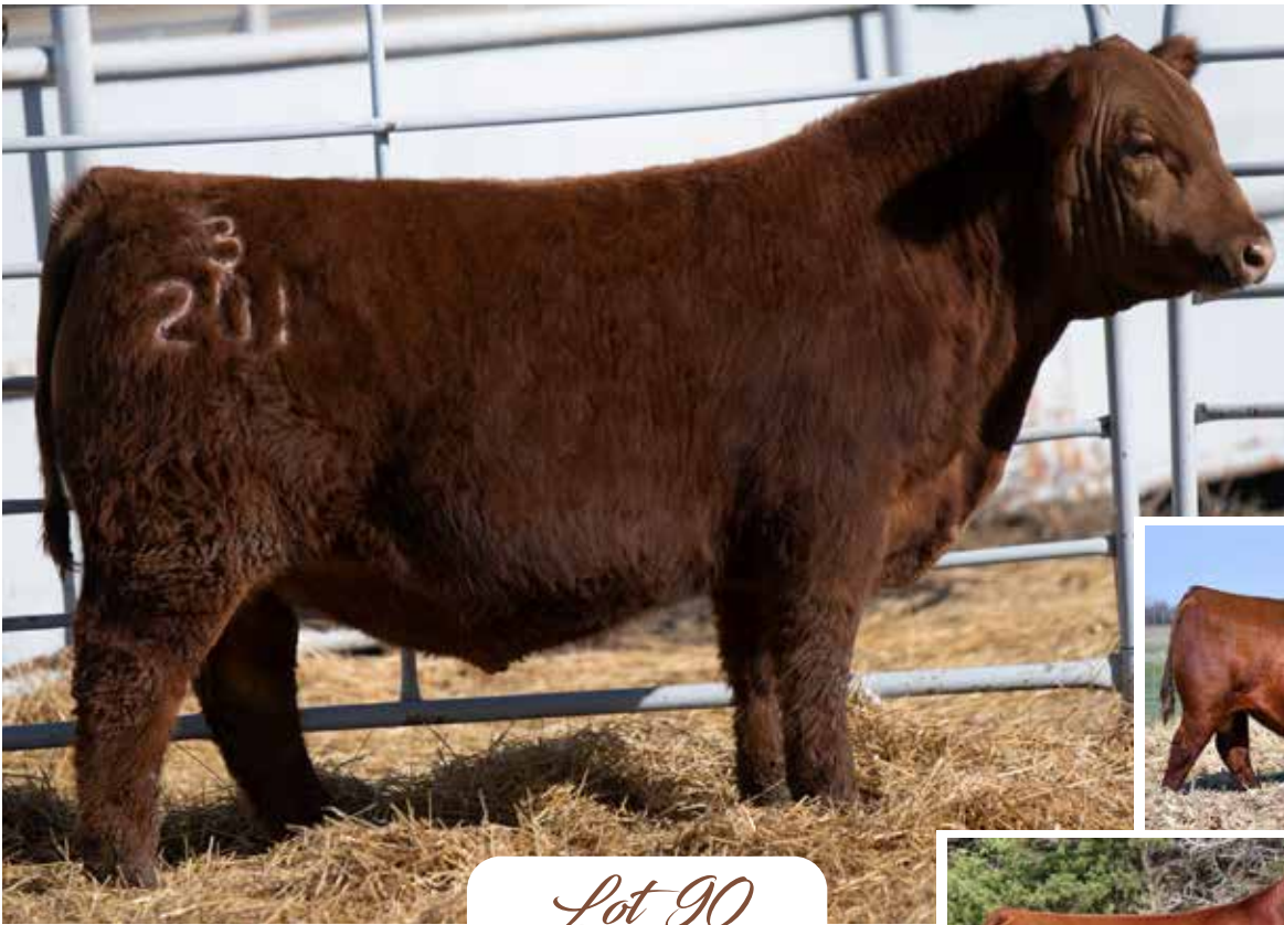
LSF SRR TAKEOVER 5051C Sire of Lots 90-92